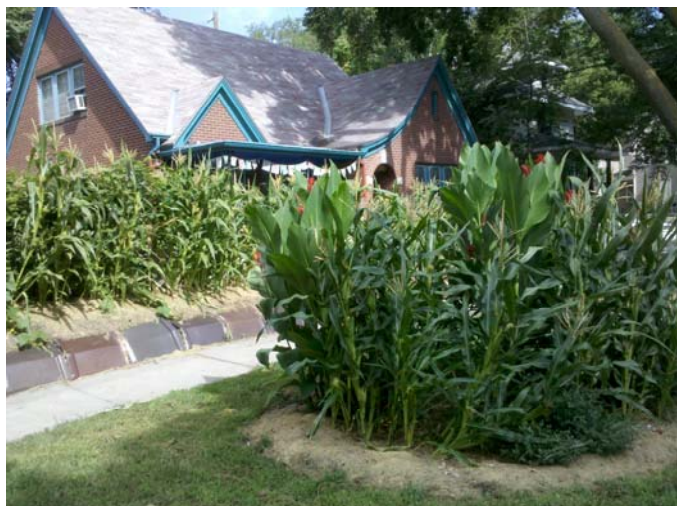
This park space area is NOT compliant with city ordinances.