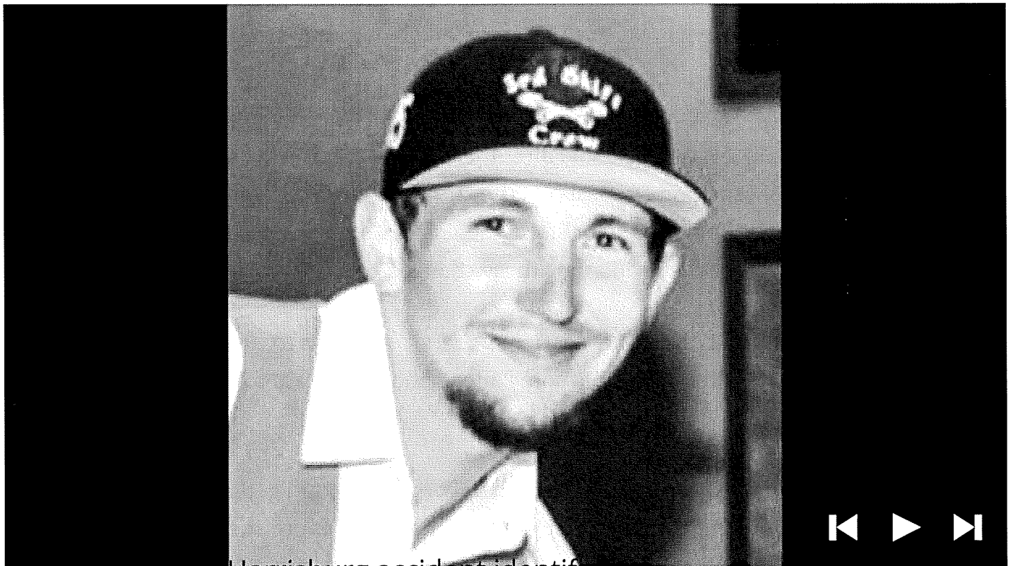
Man killed in Harrisburg accident identified